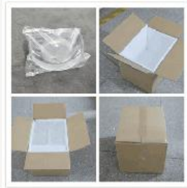
General Packaging: PE bag/ bubble bag + foam card + outer box