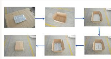
Safety Packaging: PE bag/ bubble bag + foam card + inner box + outer carton